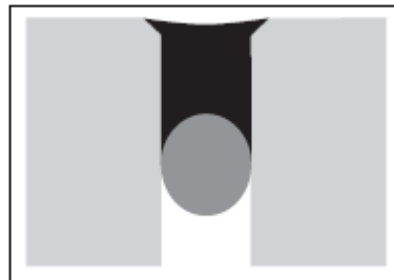
Flush joint design rules out trip hazards and dirt traps

Backing: Use closed cell, polyethylene foam backing rods.