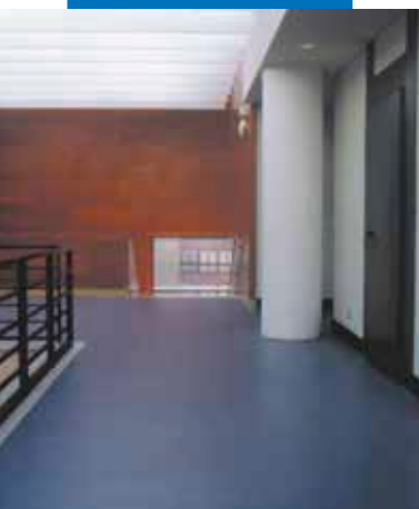
An example of an installation of linoleum on a surface levelled with Ultraplan - Monzón Conservatory - Spain