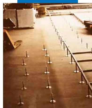
Slab levelled with Ultraplan ready for fixing a floating floor