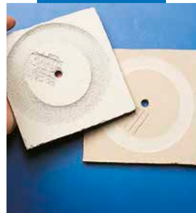
Taber abrasion executed on Ultraplan (right specimen) and on conventional levelling (left specimen) after 200 cycles