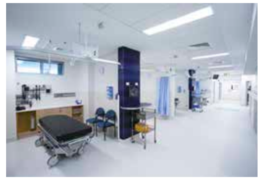
Geelong Hospital - Vinyl installed at the Geelong Hospital Emergency Department after the concrete was levelled with Ultraplan