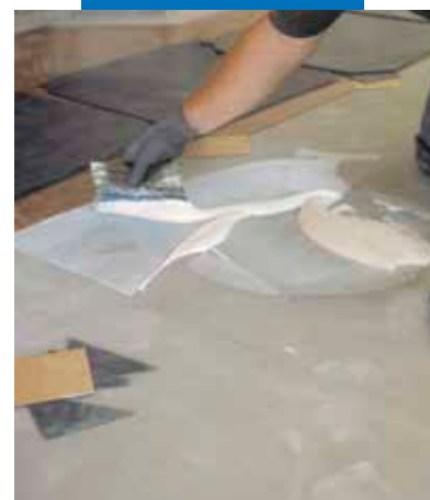
An example of an installation of inlaid PVC on a surface levelled with Ultraplan - CD2 - Milan - Italy