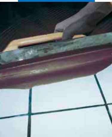
Application of Ultraplan with a metal trowel on an existing ceramic tile floor after the application of Eco Prim T Plus