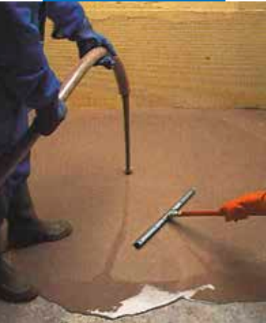
Application of Ultraplan with pump and squeegee