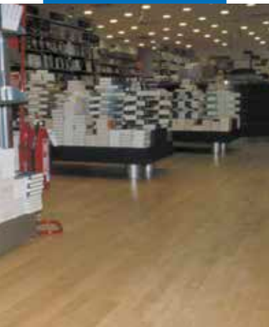
An example of an installation of timber flooring on a surface levelled with Ultraplan - Messagerie Musicali - Rome - Italy

ANY ALTERATION TO THE WORDING OR REQUIREMENTS CONTAINED OR DERIVED FROM THIS TDS EXCLUDES THE RESPONSIBILITY OF MAPEI.