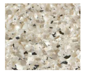
CCS Galaxy Grey Granite