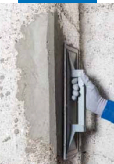
Floating the surface of Planitop Smooth & Repair R4 to create a smooth finish