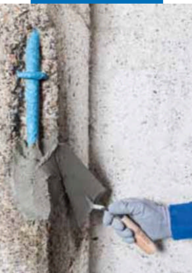
Applying Planitop Smooth & Repair R4 with a trowel